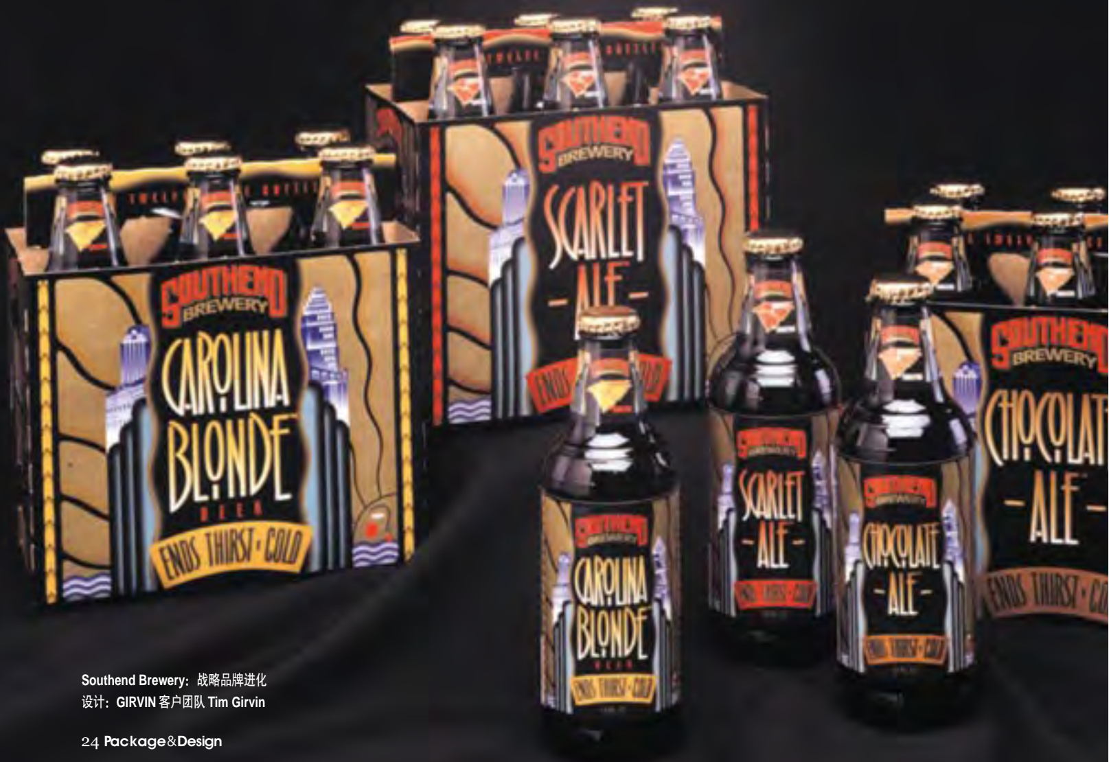
Southend Brewery: 战略品牌进化