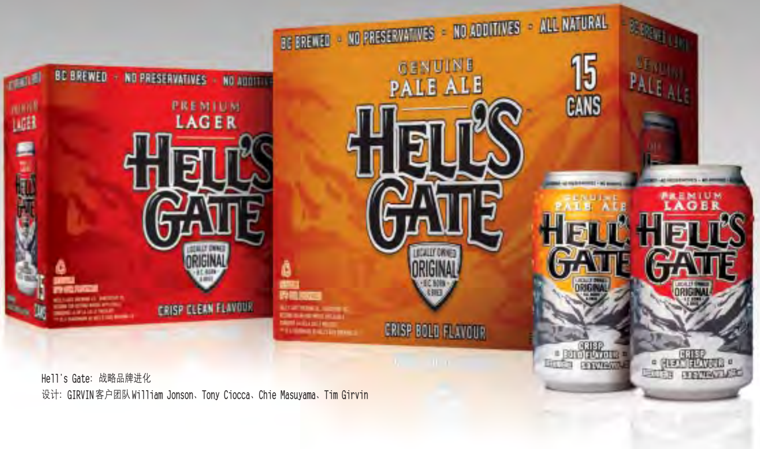
Hell's Gate: 战略品牌进化