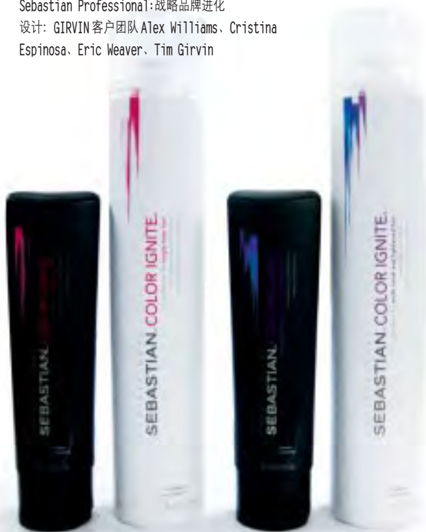
28 Package & Design